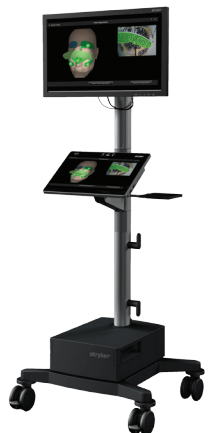
Stryker ADAPT Platform